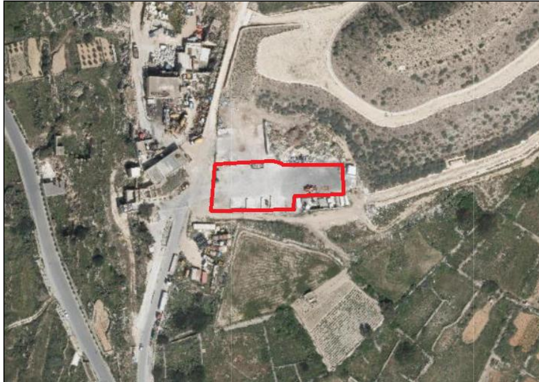
Fig. 2.1: Site of permitted installation, showing extent of area in red, for the carrying out of the activities specified in condition 1.1.1. The extent of the site boundary is indicative and shall not be used for interpretation purposes.