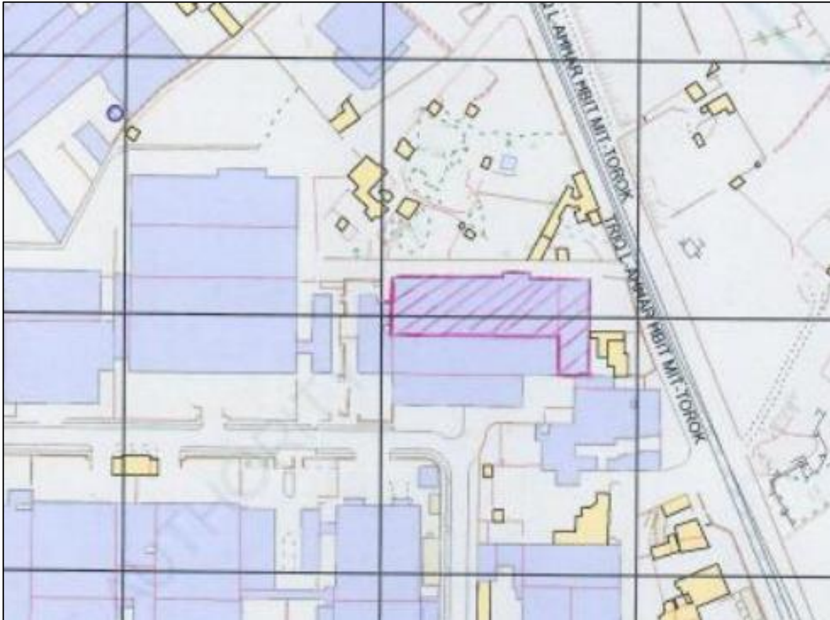
Fig. S2.1: Site of permitted installation, showing the extent of the area (in red) for the carrying out of the activities specified in condition 1.1.1. The extent of the site boundary is indicative and shall not be used for interpretation purposes.