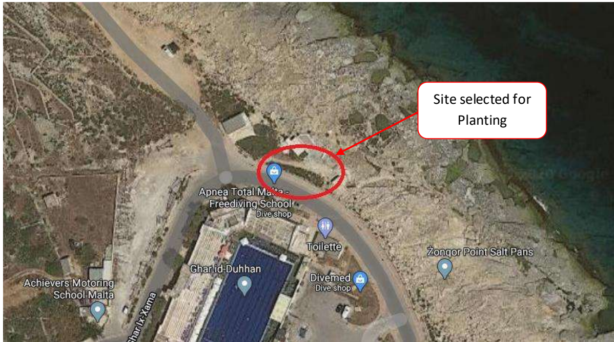
Figure 1: Aerial photo showing location of the site that will be restored (more detail will be found in site plans)

The specific site where the trees will be planted is outlined in red in the figure below.