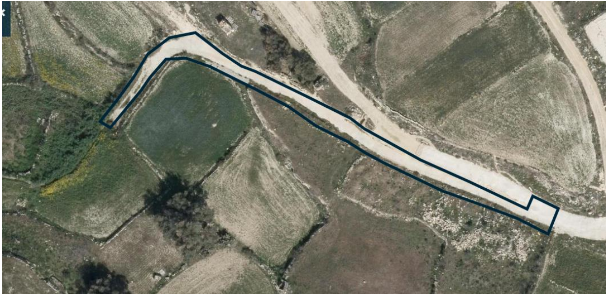
Figure 7: Map showing the location of the proposed development (zoomed)

2.2 The proposed development is located in an open rural area known as 'Landar ta' Geriska, in Gharb. The area is relatively free from physical development, predominantly characterised by sloping terraced fields and coastal cliff areas. The wider context is important for its overall natural state as well as scenic aspect.