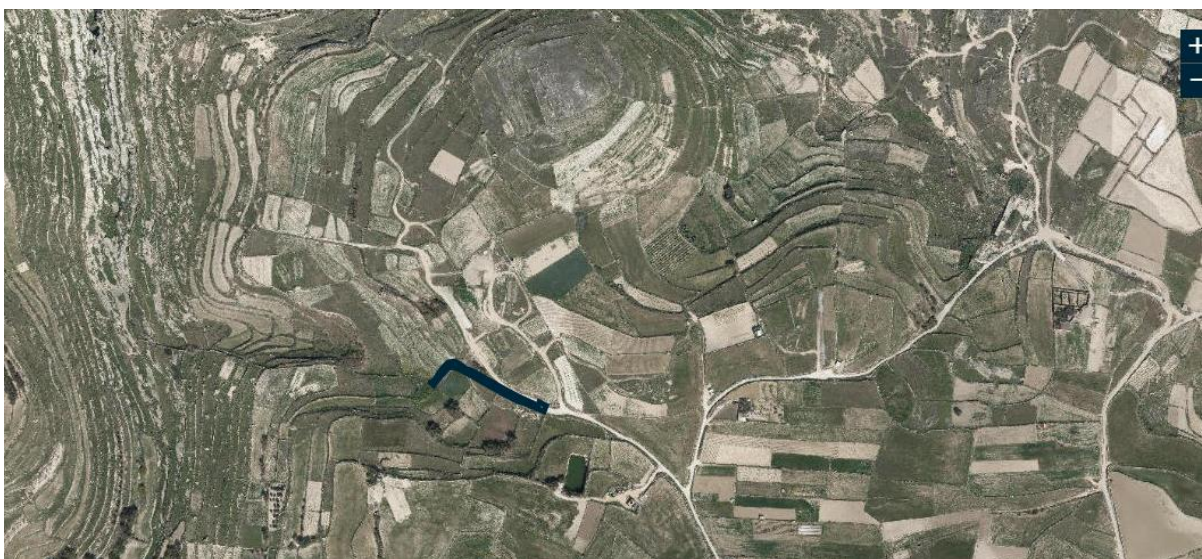
Figure 6: Map showing the location of the proposed development

2.1 The proposed site is located Outside Development Zone (ODZ) and lies at id-Dahla tal-Geriska in Gharb, Gozo (Figures 6 and 7). This is a rural road connected to Triq San Dimitri and also to Triq id-Dahla ta' Cini. The site can be accessed from Triq San Dimitri and Sqaq Ta' Cini.