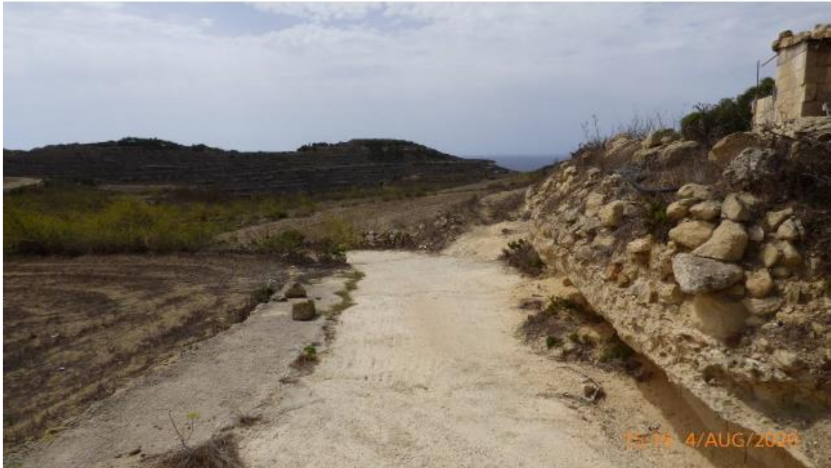
Figure 5: Another part of the rural road to be sanctioned