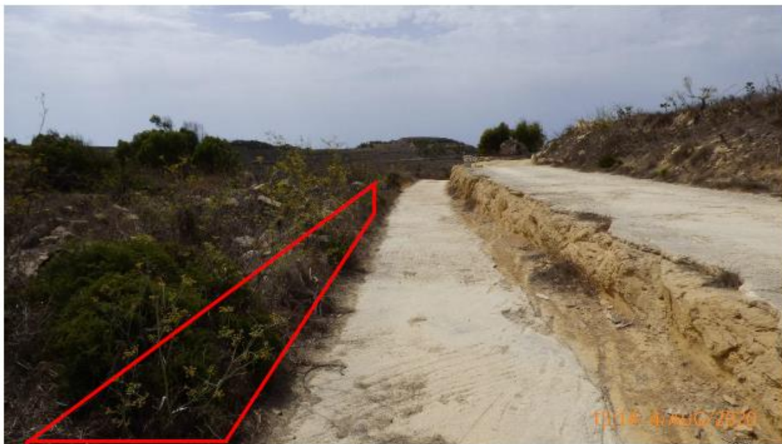
Figure 2: The area indicated in red is proposed for widening, part of the existing rubble wall will be rebuilt. The request also involves the trimming of rock to lower the rock to existing road level