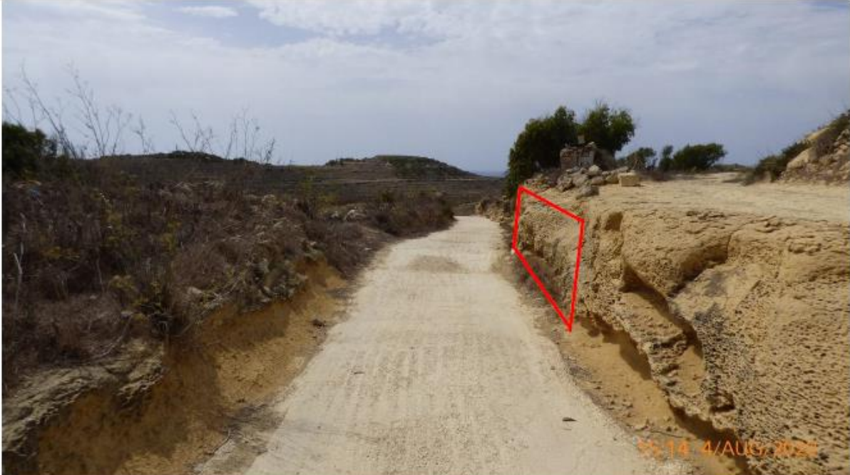
Figure 3: Shows some of the rocks that would need to be trimmed to widen the road