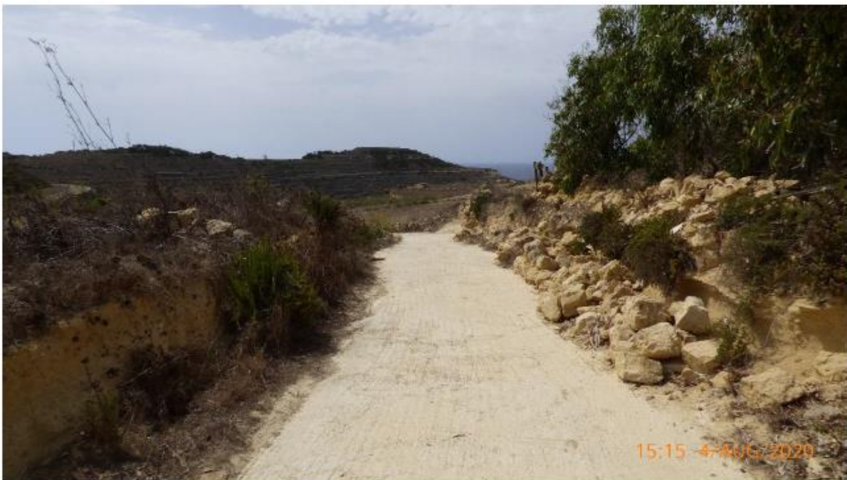
Figure 4: Shows the third party rubble walls to be restored and part of the rural road to be sanctioned