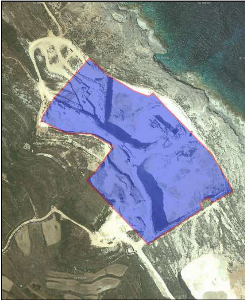
Fig. 3.1: Site of installation, showing extent of area authorised for activity for the carrying out of the activities specified in Condition 1.1.1. The extent of the site boundary is indicative and shall not be used for interpretation purposes.