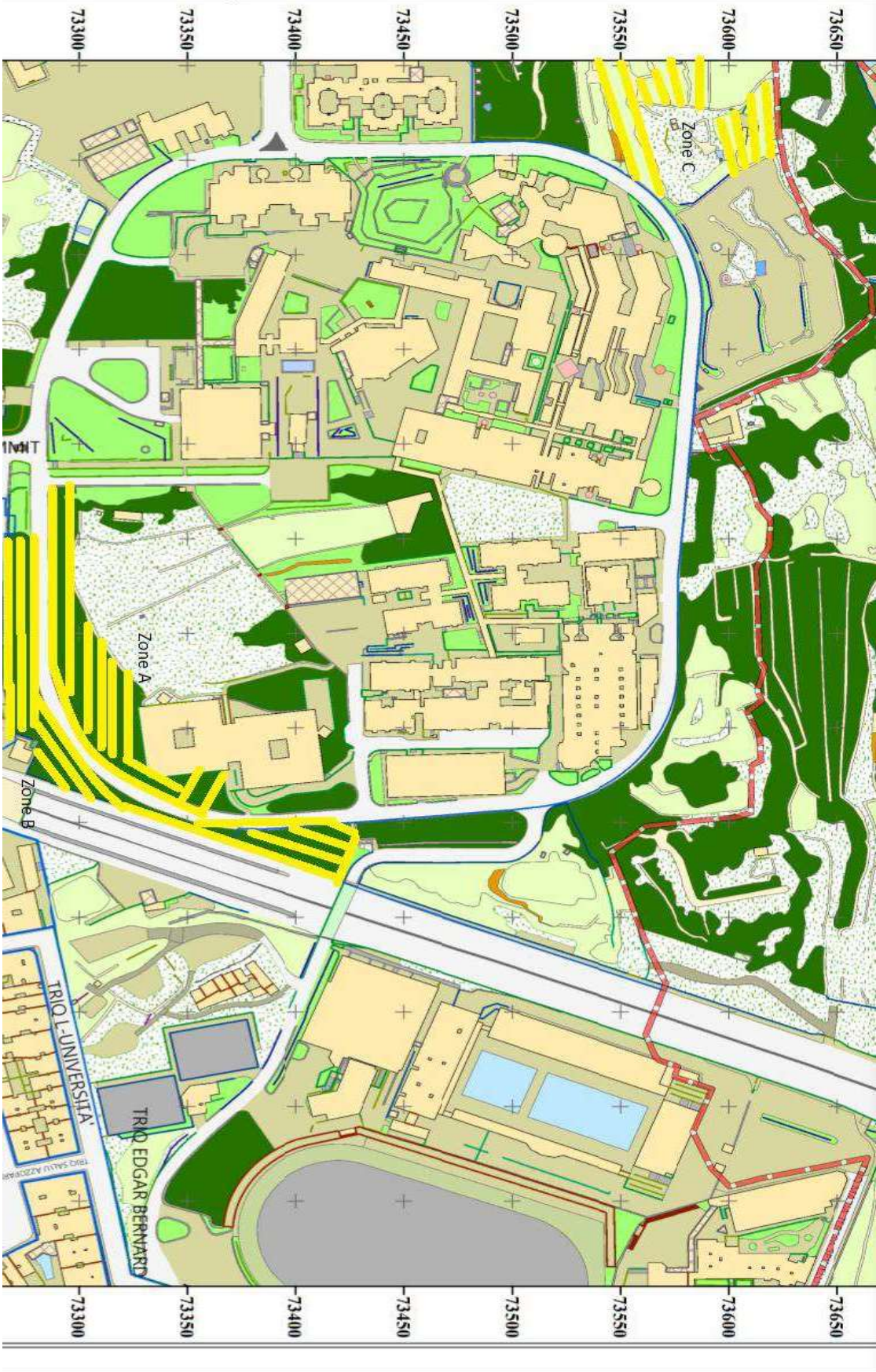
Figure 1: Compensation Plan