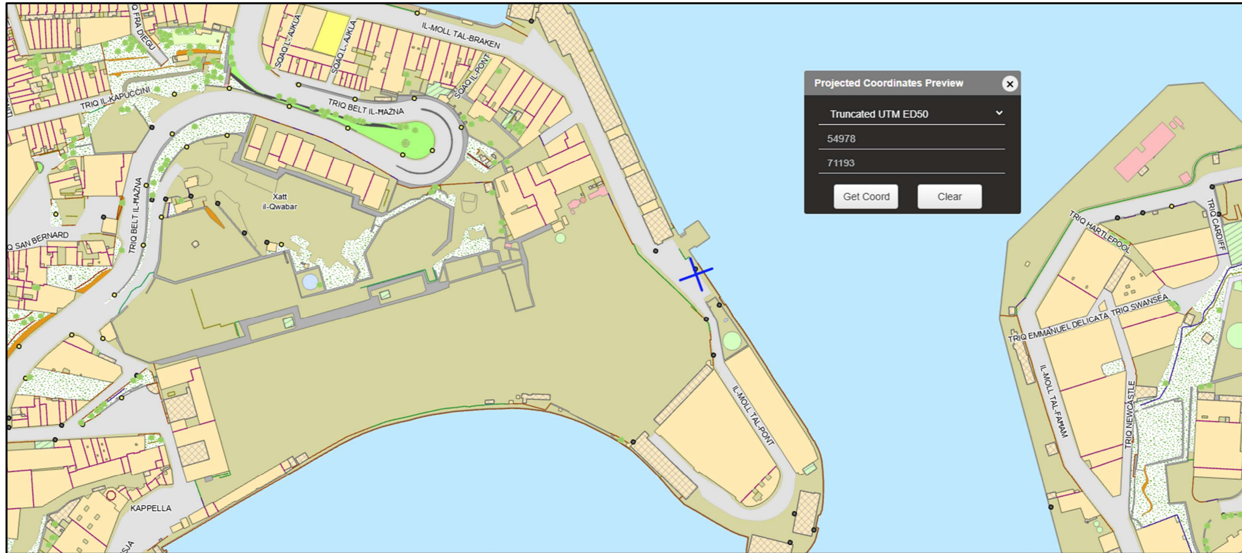
Fig 2. Discharge point marked in blue, showing location of area authorised for operation. The extent of the site location is indicative and shall not be used for interpretation purpose.