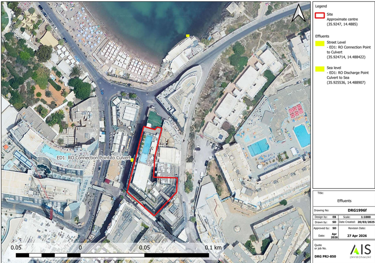
Fig. S1.2 Site layout plan showing the location of emission point to sea from the installation. The location point is indicative and shall not be used for interpretation purposes.