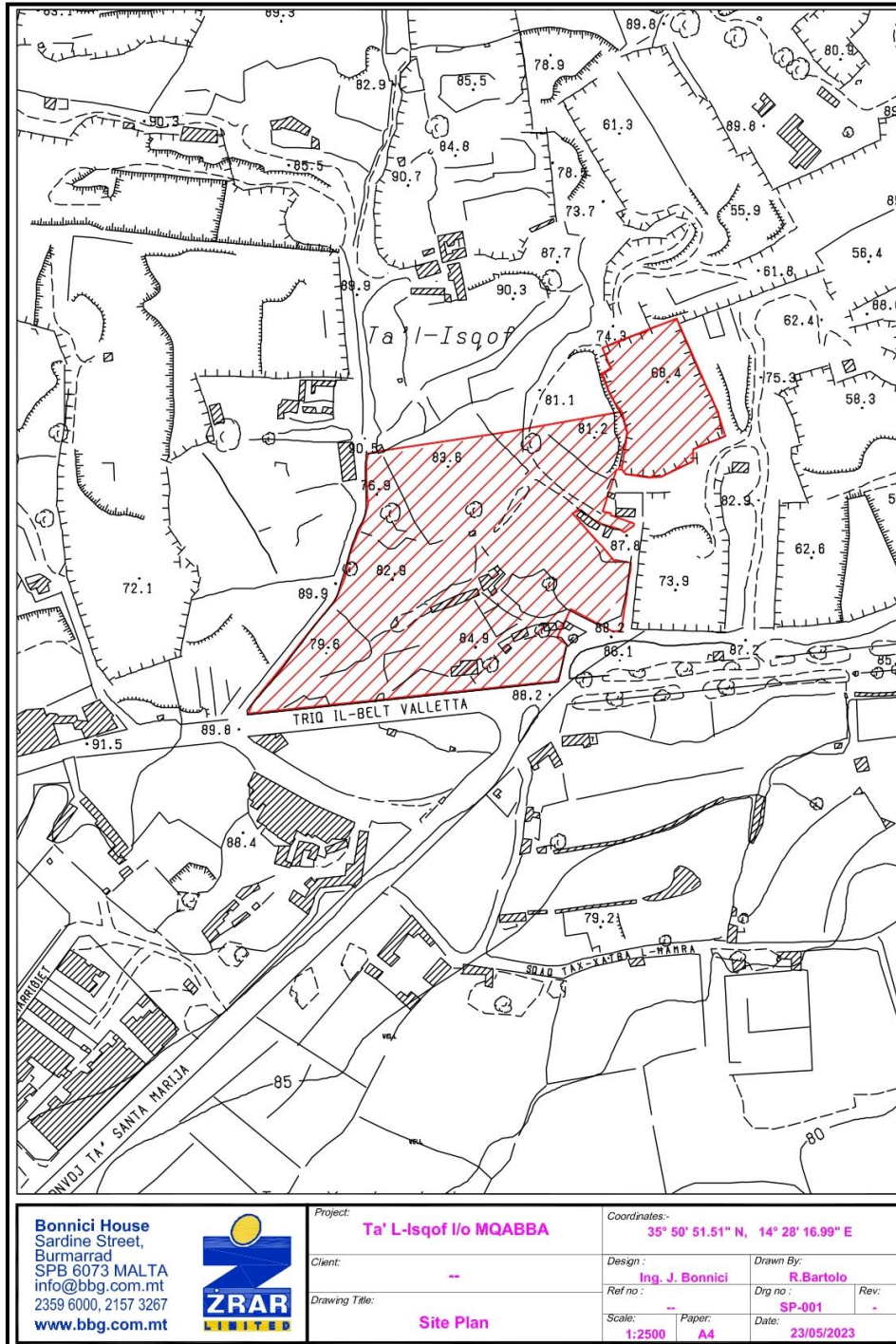
Fig. 3.1: Site of installation highlighted in orange, showing extent of area authorised for operation for the carrying out of the operations specified in Condition 1.1.1. The extent of the site boundary is indicative and shall not be used for interpretation purposes.