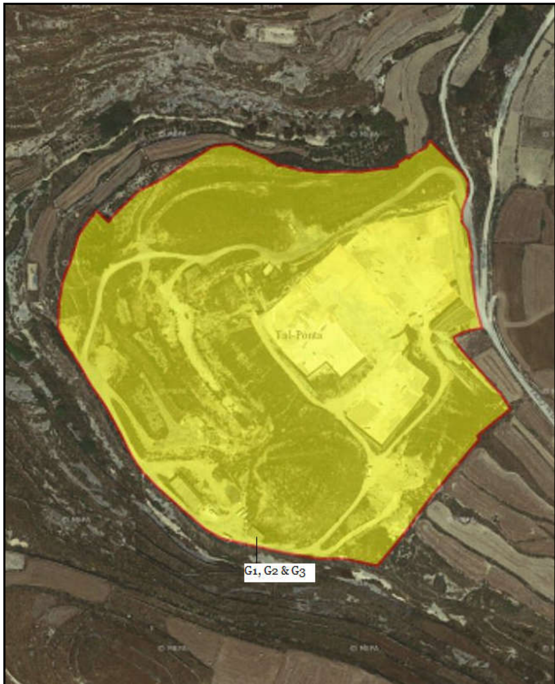
Fig. 3.2: Site of installation, showing extent of area authorised for activity for the carrying out of the activities specified in Condition 1.1.1. The extent of the site boundary is indicative and shall not be used for interpretation purposes.