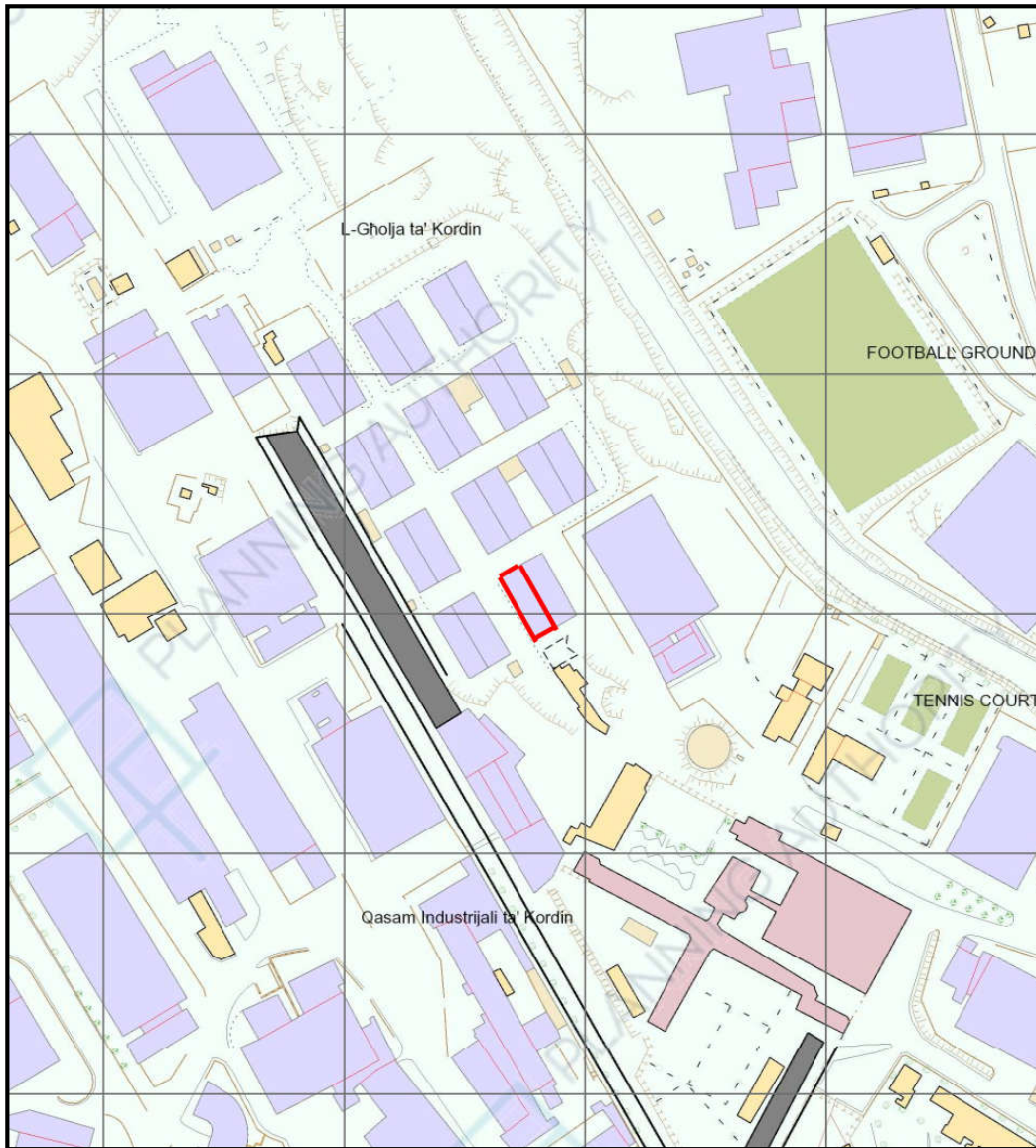
Fig. 2.1: Site of permitted installation, showing extent of area outlined in red, for the carrying out of the activities specified in condition 1.1.1. The extent of the site boundary is indicative and shall not be used for interpretation purposes.