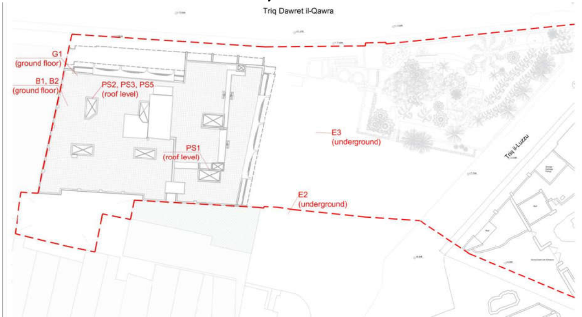
Figure S4.1 Site Layout Plan for emission and effluent points for the hotel building