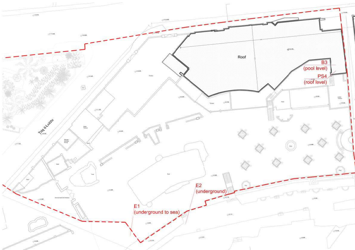
Figure S4.2 Site Layout Plan for emission and effluent points for the Lido building