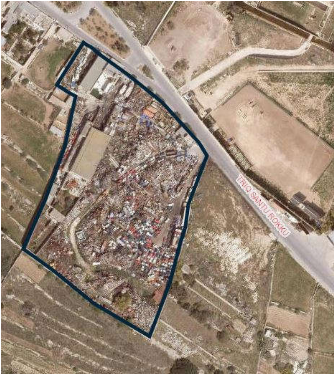
Fig. 2.1: Site of permitted installation, showing extent of area delineated in blue/black, for the carrying out of the activities specified in condition 1.1.1. The extent of the site boundary is indicative and shall not be used for interpretation purposes.