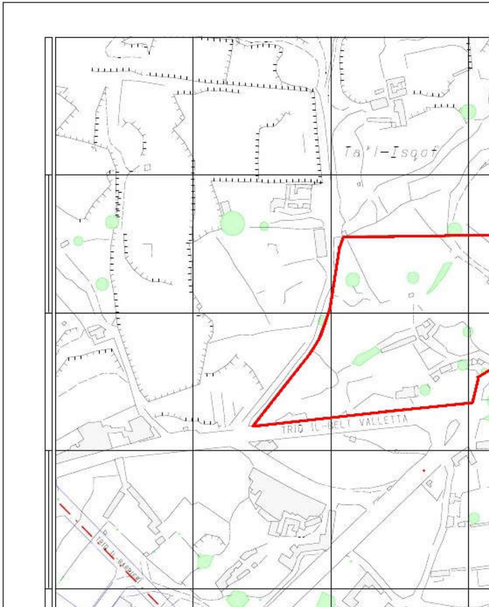
Fig. 3.1: Site of installation in red, showing extent of area authorised for activity for the carrying out of the activities specified in Condition 1.1.1 as per area 1. The extent of the site boundary is indicative and shall not be used for interpretation purposes.