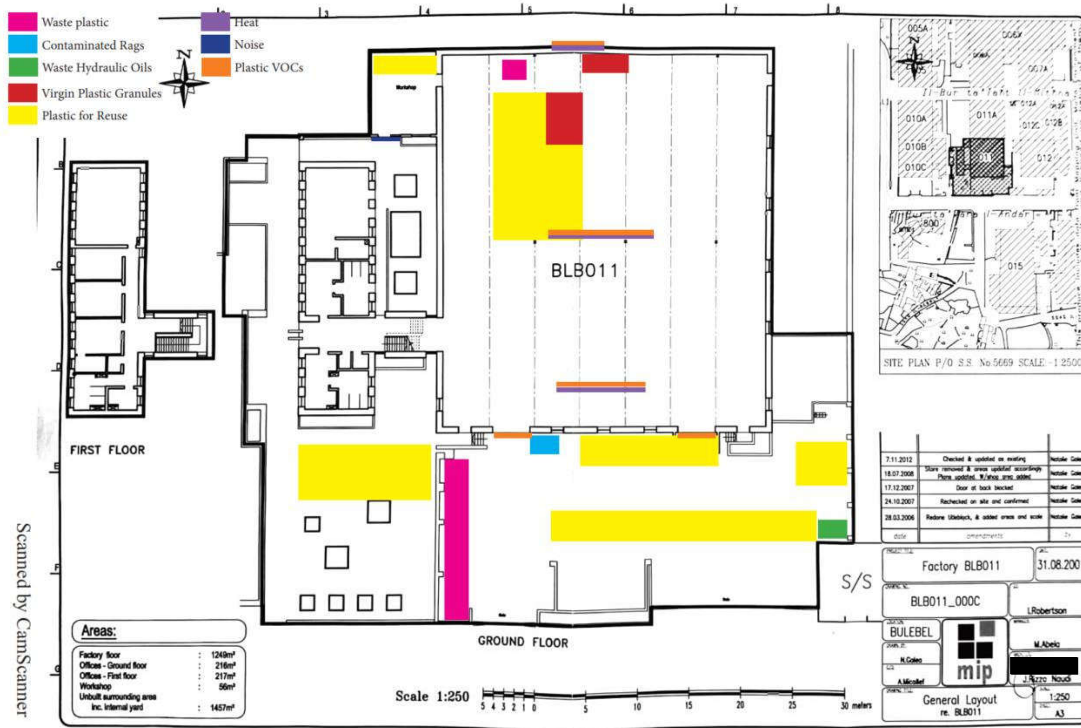
Fig. 2.2: Site layout plan for the carrying out of the activities specified in condition 1.1.1. The extent of the site boundary is indicative and shall not be used for interpretation purposes.