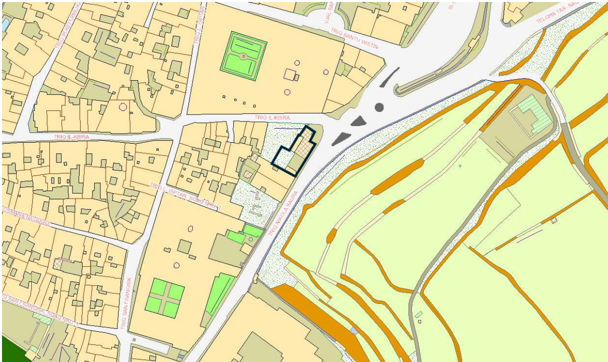
Figure S4.1: Site of installation showing the extent of the area in blue for the carrying out of the activities specified in Condition 1.3.1. The extent of the site boundary is indicative and should not be used for interpretation purposes.