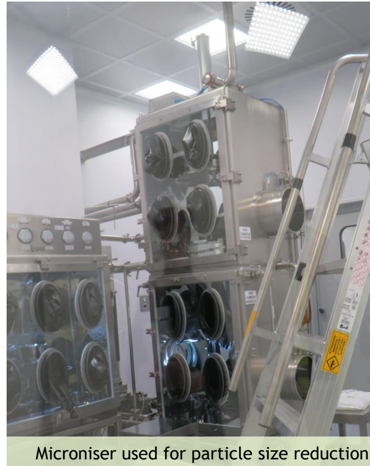
Microniser used for particle size reduction