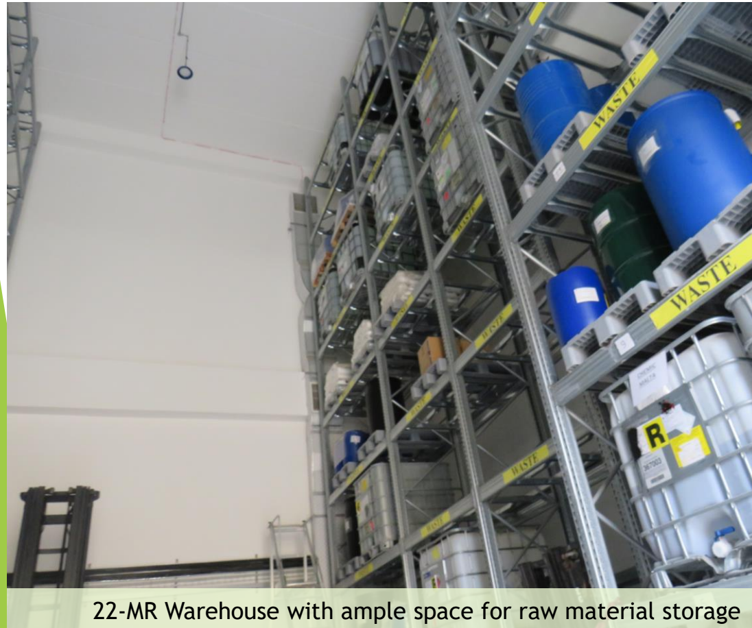
22-MR Warehouse with ample space for raw material storage