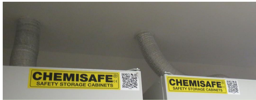
Fire Safety Cabinets storing small amounts of raw material