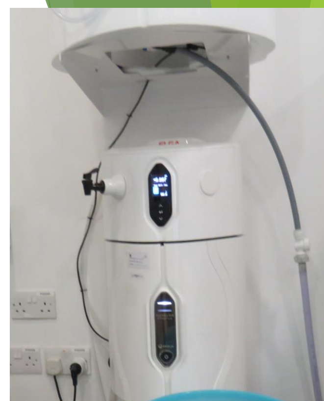
RO for cleaning glassware