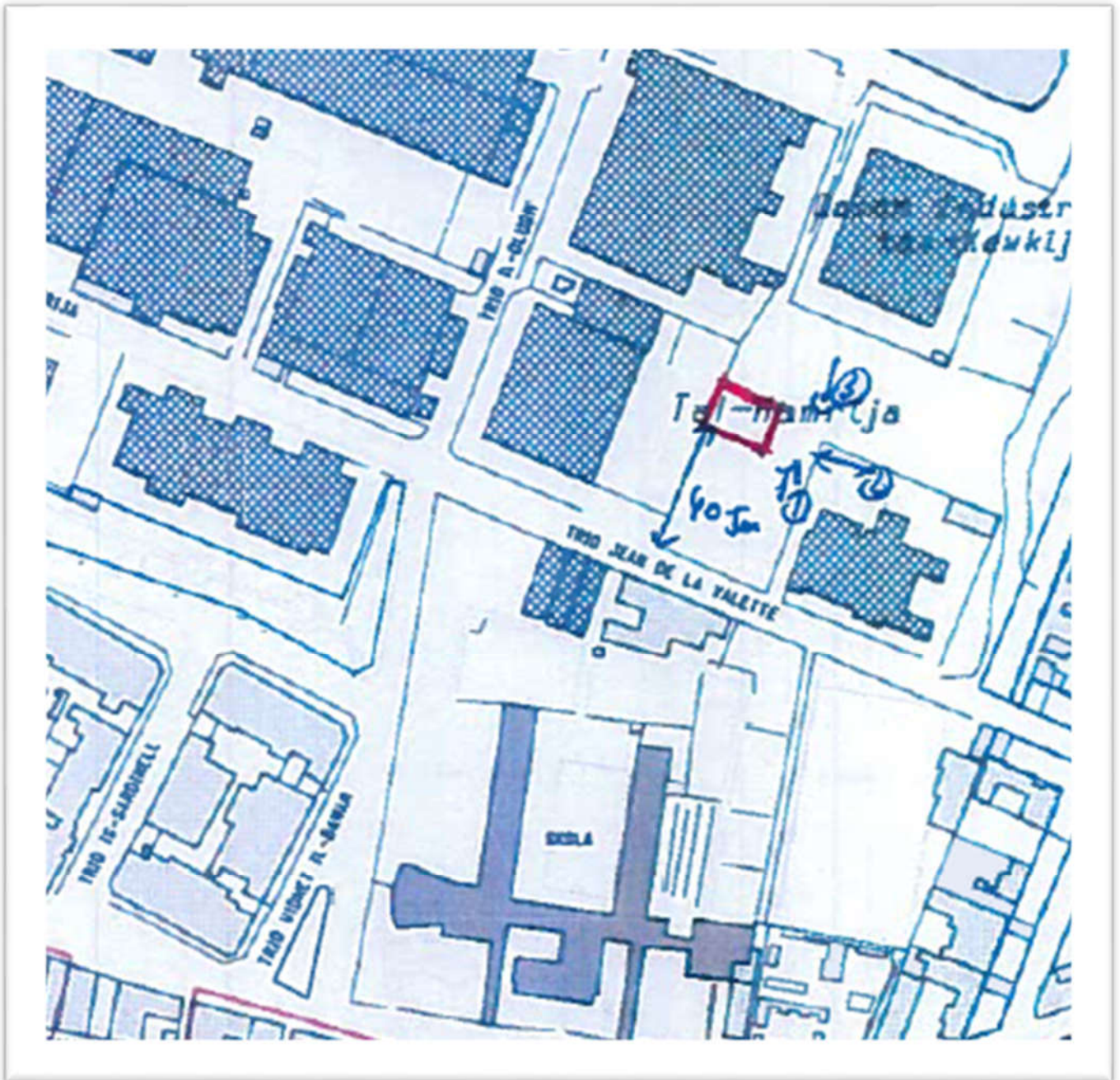
Fig. S2.1: Site of the permitted installation, showing the extent of the area outlined in red to undertake the operations specified in condition 1.1.1. The extent of the site boundary is indicative and shall not be used for interpretation purposes.